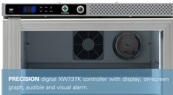
PRECISION digital XW737K controller with display, on-screen graph, audible and visual alarm.