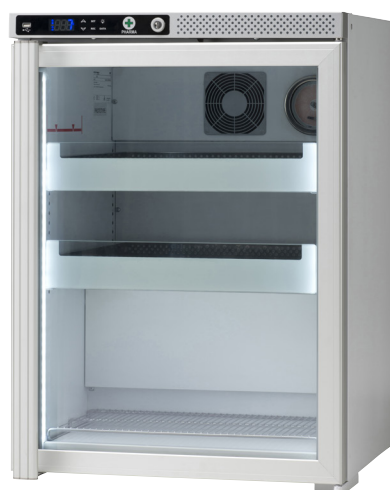
Model shown with drawers (optional)