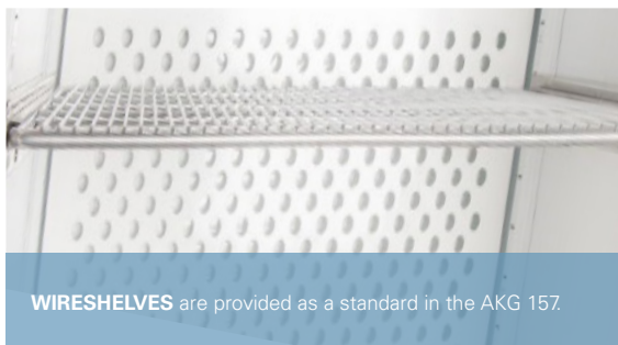
WIRESHELVES are provided as a standard in the AKG 157.